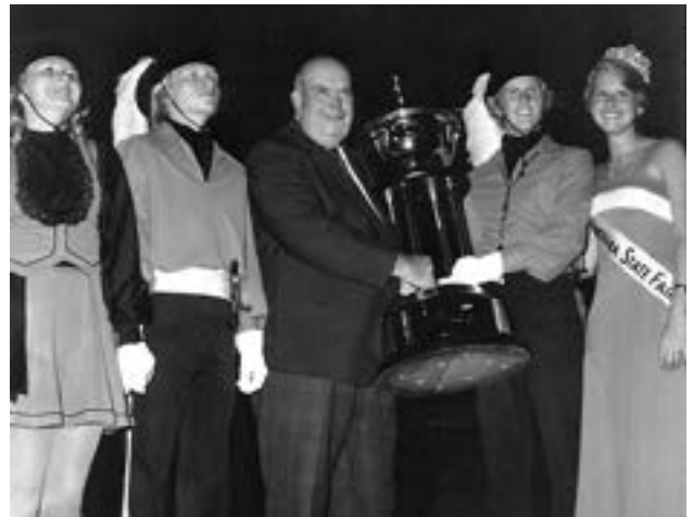
1976 State Fair Grand Champion trophy